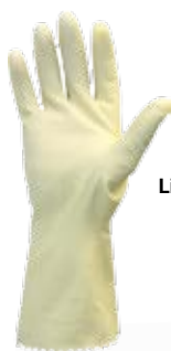
Lightweight and Standard