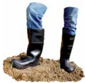
8445 / 4906