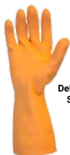
Deluxe and Deluxe Super Flexible