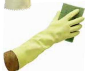
Heavy Duty Extra Long